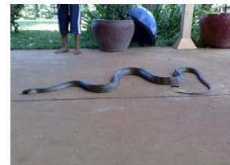
Five minutes later, cooked in ginger and chillies-delicious!