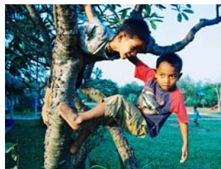
Trees are for climbing!